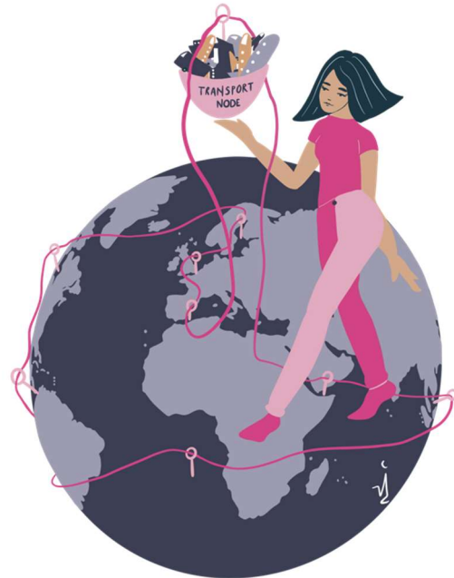
Figure 2: Supply Chain Visibility enabled by digitally connected transport nodes

Digitalisation offers capabilities for transport nodes to be highly integrated in the transport ecosystem. This concerns supporting both the coordination of physical operations, and the provision of fossil-free energy, both for sustainable node operations and for fuelling episodic visiting carriers, and as an enabler of the green conversion of the transport ecosystem, but also to seek new services opportunities. At the core, collaboration enabled by digital interaction and data streams will expand the transport node’s event horizon and improve situational awareness providing opportunities for optimising resource and infrastructure utilisation.