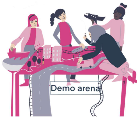
Figure 4: Demonstration arena exploring different innovations

To pursue ecosystem innovation in authentic settings, arenas that support participants in joining forces to investigate and overcome common concerns need to be established. Within the frame of